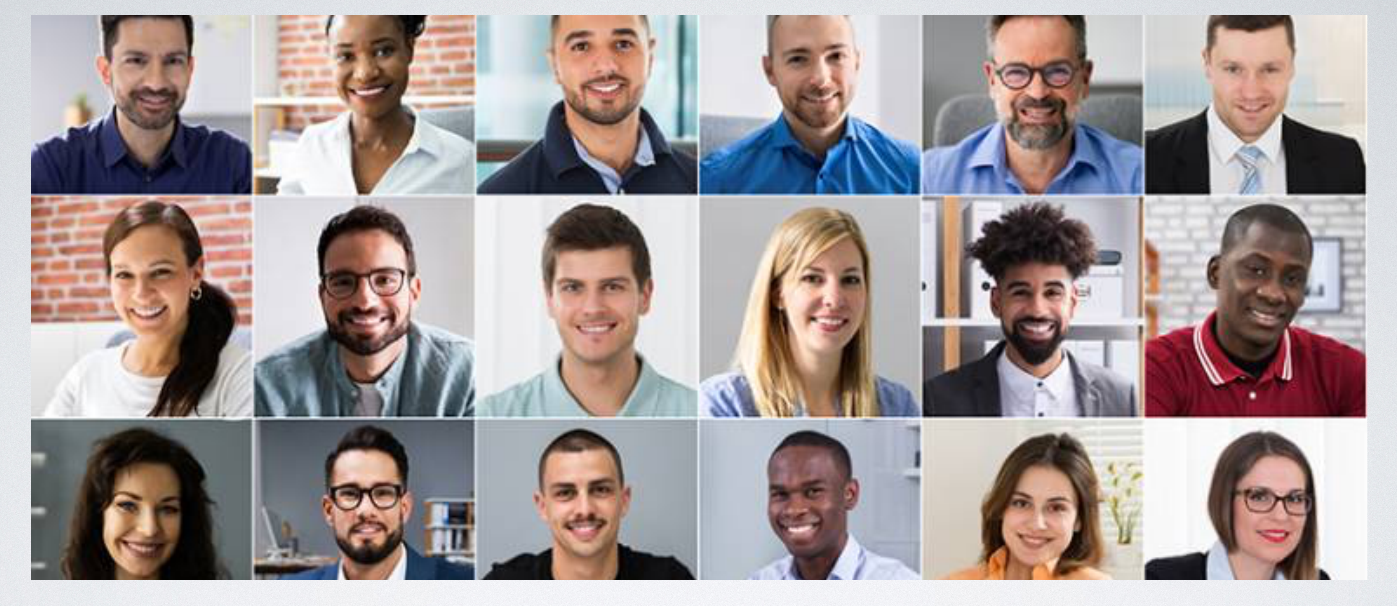
2024/25 Sunday school Year - Lesson 14